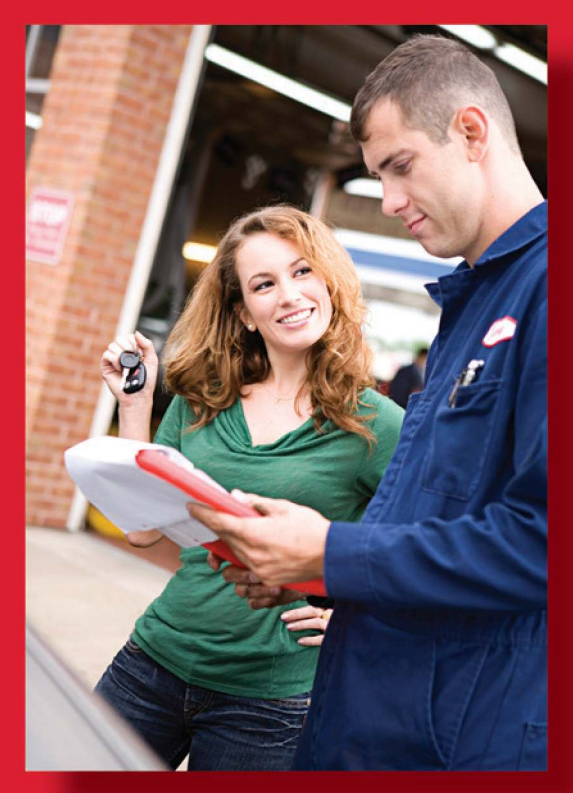
TECHnovation™ is the natural evolution to Perfection's " Service The System™ " approach to clutch repair which leads to longer life and more importantly... happy customers.