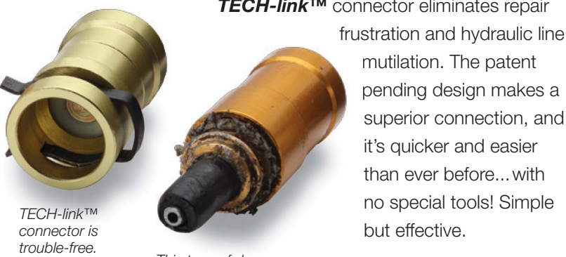
This type of damage can occur with OEM connectors.